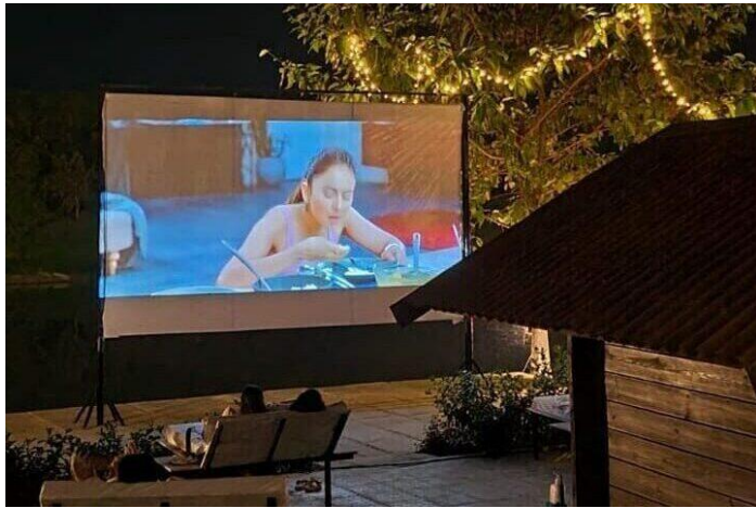
OUTDOOR MOVIE THEATRE