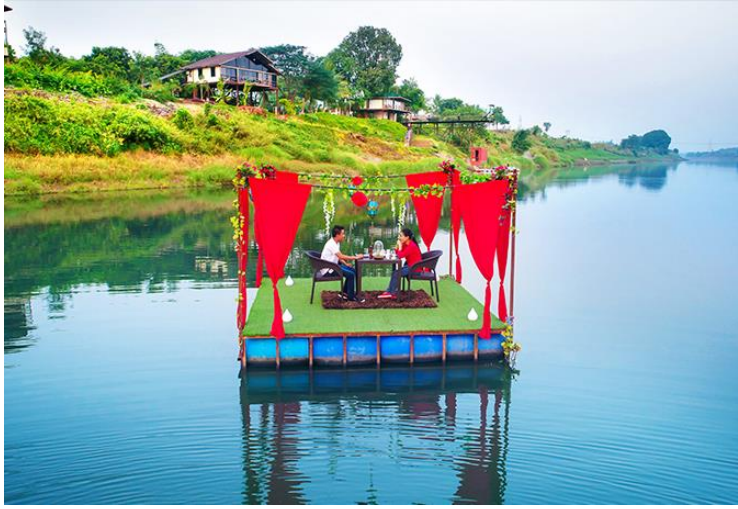
DINNER ON RAFT