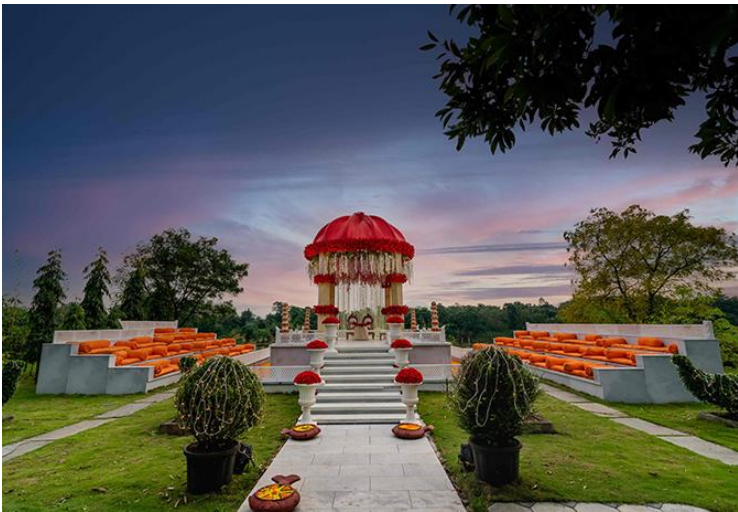
PERFECT WEDDING DESTINATION