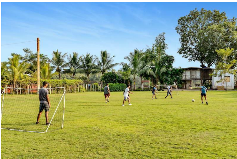
FOOTBALL / CRICKET